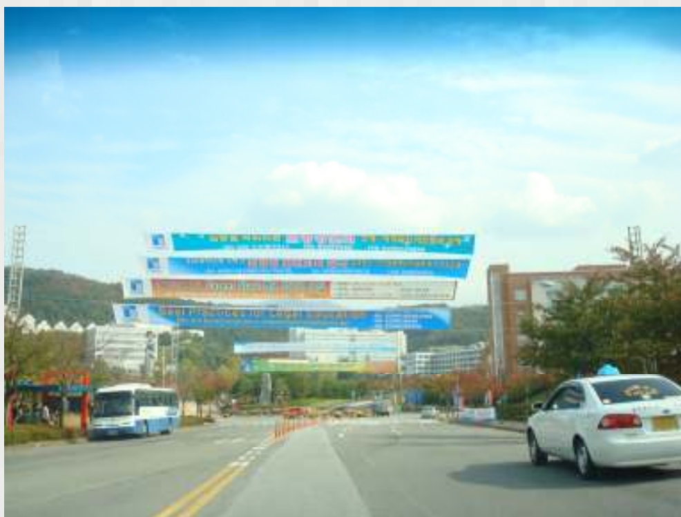
Chosun University Law School