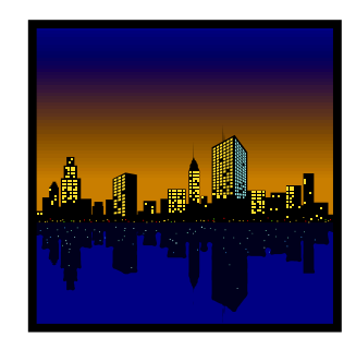
Chicago, Illinois April 29- May 3, 2005