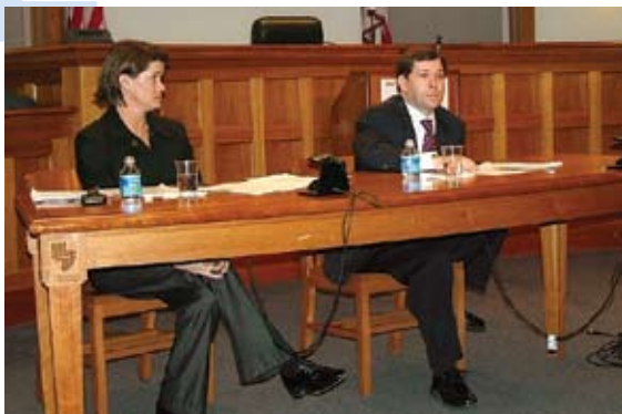
Experienced recruiters reminded job seekers that the easiest mistakes to avoid, such as typos on résumés, are also the most common they see.

A second program, offered by OCPD on Jan. 26, carried the theme a bit further. Students were again reminded that what may seem like minor points sometimes matter the most and can be the difference between receiving an offer or not.